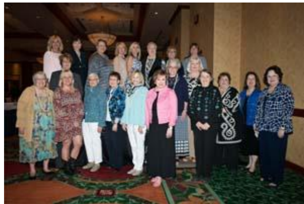
2016 ALTA Board of Directors