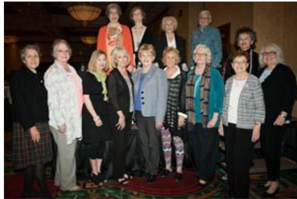
30 Year Member Awardees