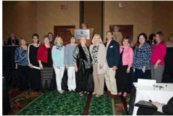
2016-2018 ALTA Board of Directors