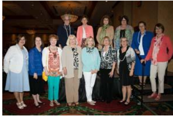
25 Year Member Awardees