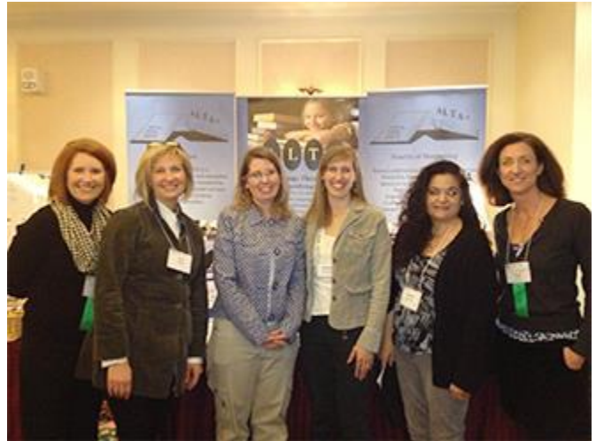
ALTA Rocky Mountain Chapter Members